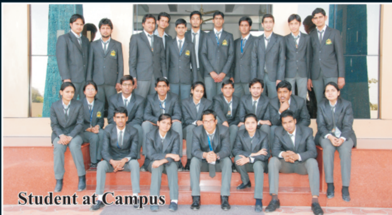
Student at Campus